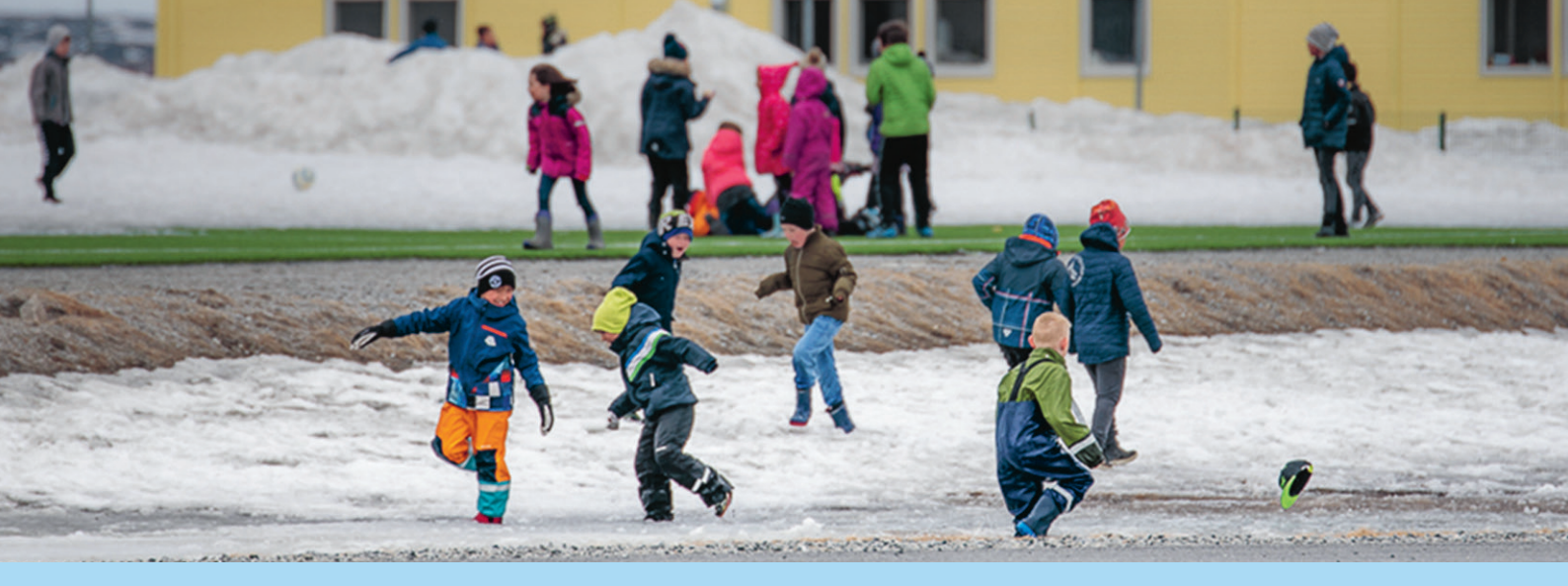
Children are the backbone of thriving rural communities.