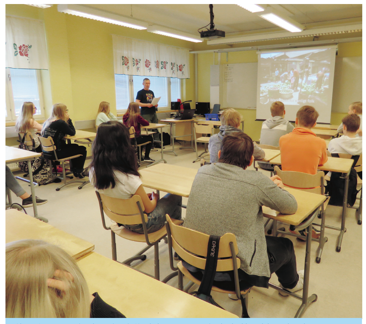
Above: Intergenerational meetings in Korsholm are empowering both older adults and students. Below right: Older adults sharing their expertise at a school in Korsholm.